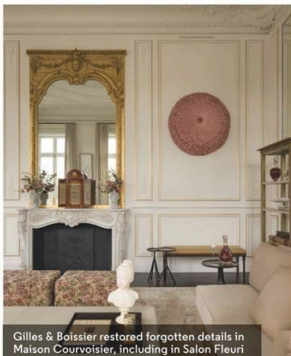
Gilles & Boissier restored forgotten details in Maison Courvoisier, including in Salon Fleuri