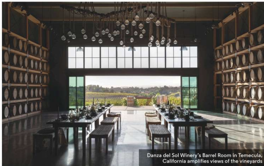
Danza del Sol Winery's Barrel Room in Temecula, California amplifies views of the vineyards