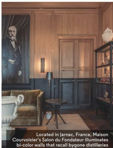
Located in Jarnac, France, Maison Courvoisier's Salon du Fondateur illuminates bi-color walls that recall bygone distilleries